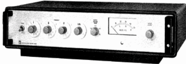
Model 1316 Oscillator

The 1316 contains a Wien-bridge oscillator isolated from the load by a low-distortion transformer coupled power amplifier. The oscillator circuit includes a provision to introduce a synchronizing signal for phase locking or to extract a signal, independent of the output setting, to operate a counter or to synchronize an oscilloscope.